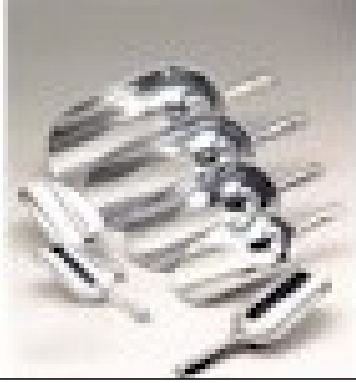
Scoops and Funnels