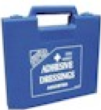
Catering Plaster Kit